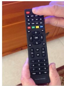
Using this remote turn on the box