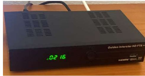
The box should then look like this