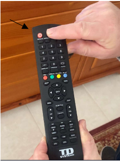
Turn on TV