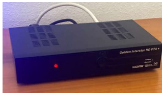
If the red light is on the Box is off